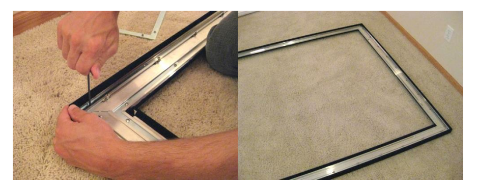
Install Last Short Side. For this fourth piece, a short side, insert its L-brackets but do not tighten at this time. Align the four L-brackets into their mating slots into the top and bottom frame pieces and slide into position.

Ball-Point Wrench the Set Screws. Confirm with your fingers at the joint that they are perfectly joined and then start tightening the set screws. Use the ball-point end of the wrench provided so that you can more easily access the screws and won't over tighten them. Repeat this so that you've joined the top, bottom and one side piece, saving the other side piece for last.